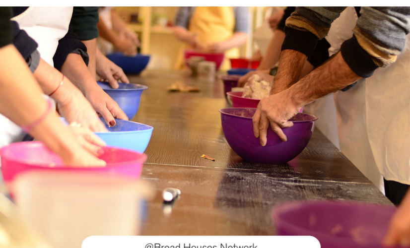
@Bread Houses Network