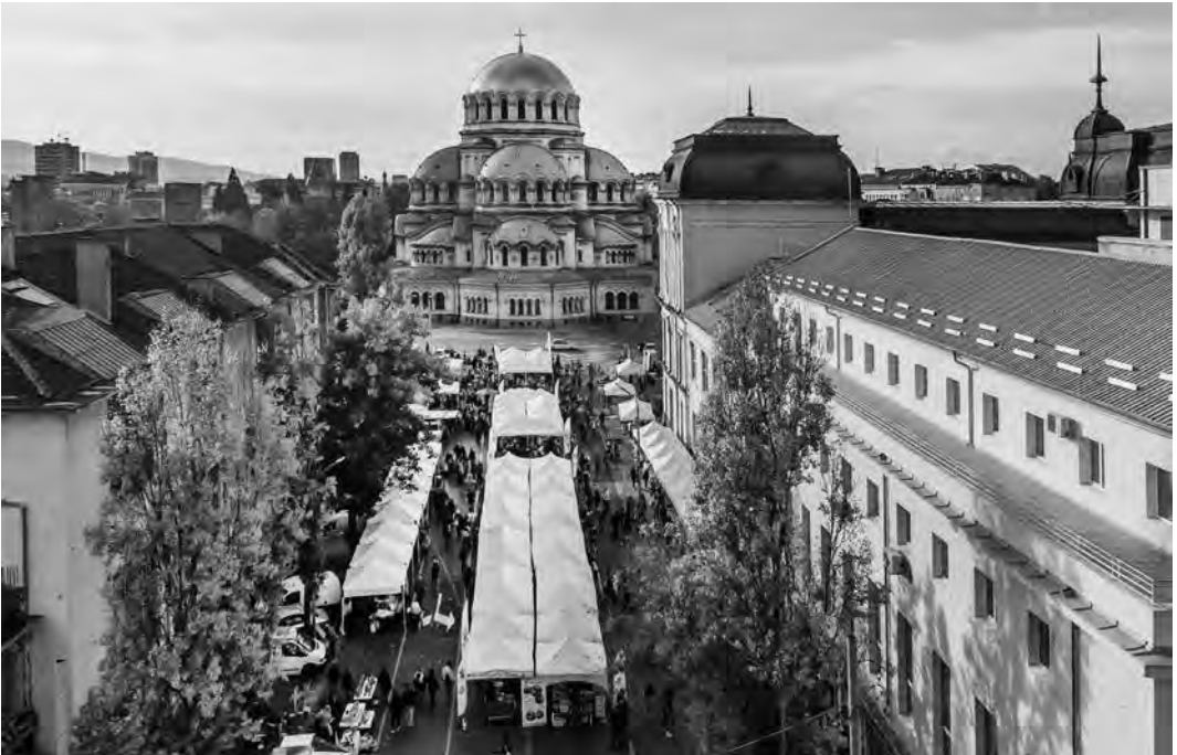
8. Catalogo URBINAT NBS, NBS economia sociale e solidale, Hrankoop Sofia, mercati degli agricoltori. Foto E. Dimitrov.

to develop mechanisms that ensure inclusive urban regeneration “by and with the people,” with effective participation that offers citizens control and cooperation, and abandoning the “for the people” as a pseudo-participatory process based on assistencialism and domestication. 16 A new understanding of community participation is “focus on broader community-driven processes in the construction of the public realm provides a critical perspective with which to transcend the binary relation between professionals and users and the limited model of participatory design.” 17