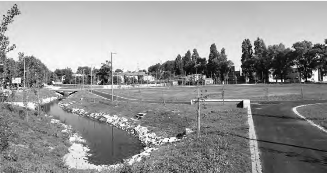
7. Catalogo URBINAT NBS, NBS territoriale, ristrutturazione di un canale d'acqua di Asprela, Porto, CIBIO.

the co-creation, co-development, co-implementation and co-assessment of solutions inspired by nature and in human-nature.