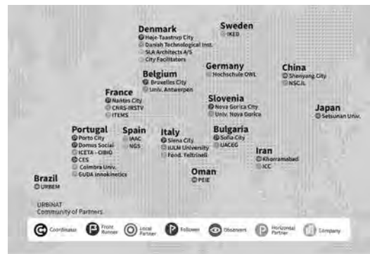
2. I partner del progetto europeo URBINAT.

The URBINAT main contribution is the understanding of the healthy corridor as co-creation