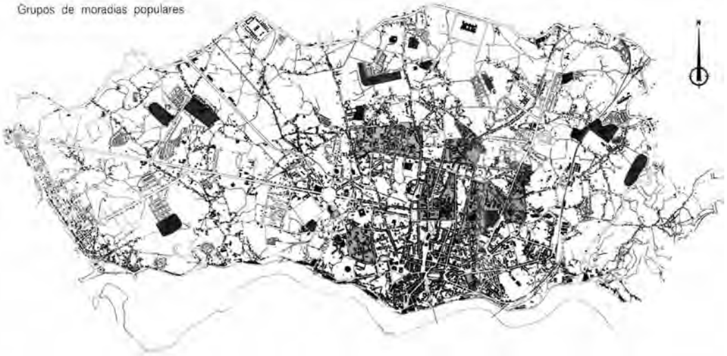
1. Plano urbano di Porto. Plano de Melhoramentos, 1956-1966. Archivio Storico del Comune di Porto, www.cm-porto.pt/os_planos_do_porto/plano-de-melhoramentos-para-a-cidade-do-porto-1956-1966 .

holders, municipality technicians, companies and researchers in order to develop together solutions for new urban challenges.