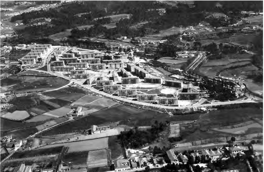
3. Quartiere di Cerco, 1961. Archivio Storico del Comune di Porto, F-NP / CMP / 7/756; F-NP / CMP / 7/757; F-NP / CMP / 7/761.

process of a public space that will be planned by and with citizens, testing an innovative and inclusive urban model to regenerate deprived districts, specifically within and linking social housing neighbourhoods. Participative-design will be the cornerstone approach in achieving new models of urban development, and design thinking process and methods that will underpin the creation of healthy corridors with NBS. The people-based design will frame the healthy condition of this corridor, designed by and for the citizens.